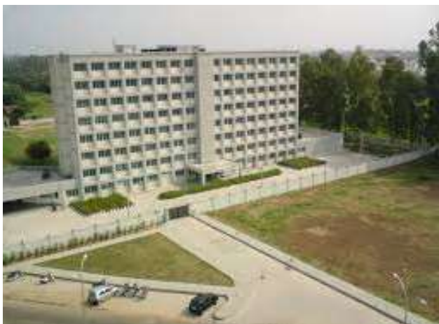
Mai Bhago Hostel (Girls)