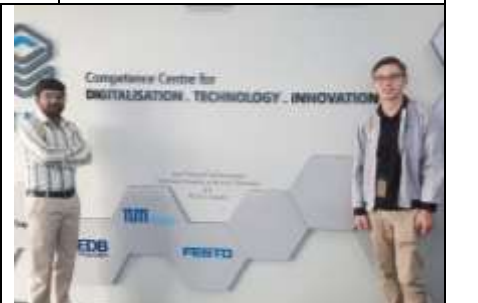
Research on Bio-Fuels Game-O-Rama Gaming Competition At FESTO Didactic, Singapore.