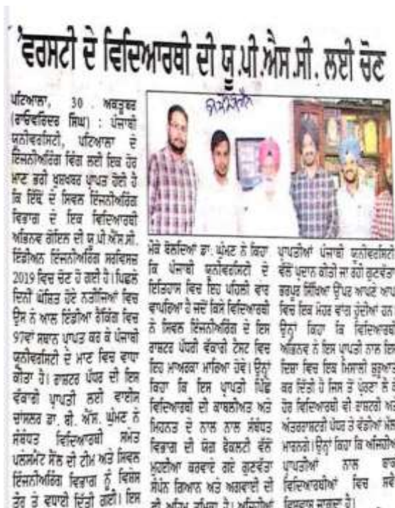
UPSC (IES) selection