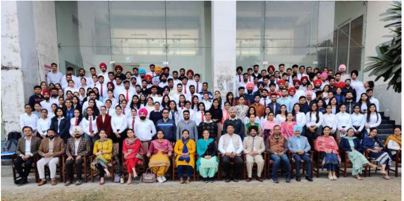
Department of Computer Science & Engineering