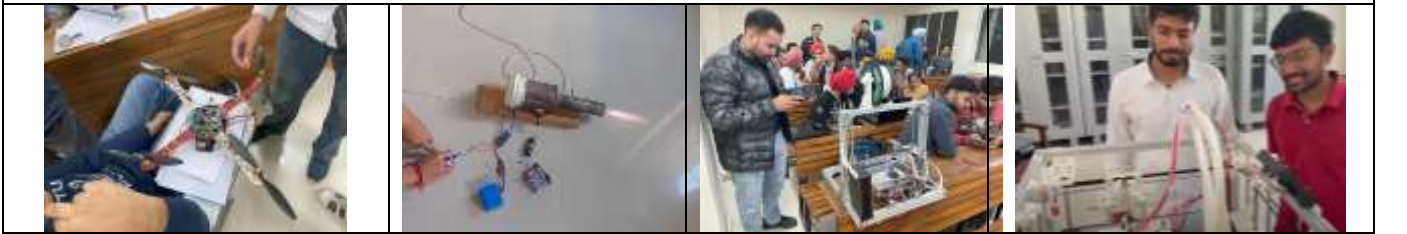
Student Project Quadcopter Student Project Jet Engine Student Project 3D Printer Student Project 20 Ltr Static Bed 3D Printer

निमोली से तैयार ईंधन डीजल में मिलाकर इस्तेमाल के लिए उपयोगी एक नए अध्ययन के अनुसार, निमोली (Nimoli) से तैयार ईंधन डीजल में मिलाकर इस्तेमाल के लिए उपयोगी हो सकता है। यह ईंधन डीजल के साथ मिलाकर इस्तेमाल करने पर ईंधन की लागत कम हो सकती है और यह ईंधन डीजल के साथ मिलाकर इस्तेमाल करने पर ईंधन की लागत कम हो सकती है।