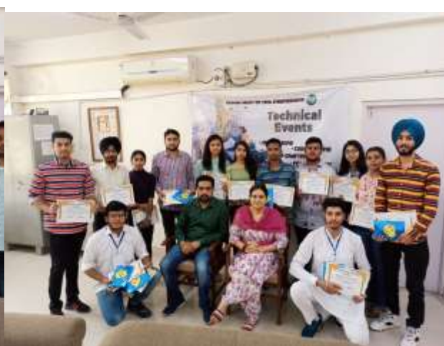
Technical Events (Cube making and quiz competition)