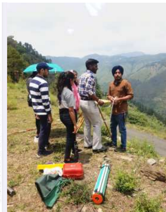
Survey Camp (Civil)