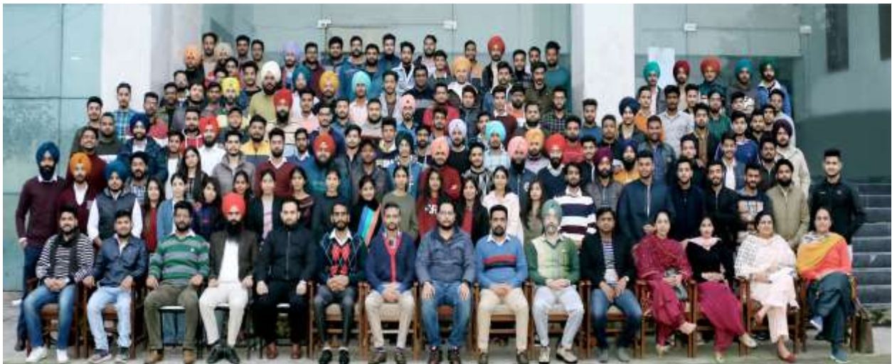
Department of Civil Engineering