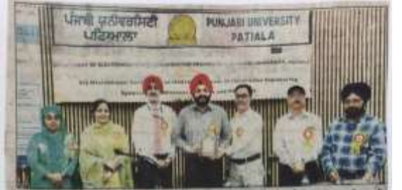
ਪੰਜਾਬੀ ਯੂਨੀਵਰਸਿਟੀ ਵਿਖੇ ਪੰਜਾਬ ਚੈਂਬਰ ਆਫ ਕਮਿਊਨੀਕੇਸ਼ਨ ਆਫ ਇੰਜੀਨੀਅਰਿੰਗ ਆਫ ਟੈਕਨੋਲੋਜੀ ਦੁਆਰਾ ਆਈ ਆਈ ਟੀ ਵਿਭਾਗ ਦੇ ਵਿਦਿਆਰਥੀਆਂ ਲਈ ਪਲੇਸਮੈਂਟ ਸਬੰਧੀ ਵਰਕਸ਼ਾਪ ਦਾ ਉਦਘਾਟਨ ਕੀਤਾ ਗਿਆ।