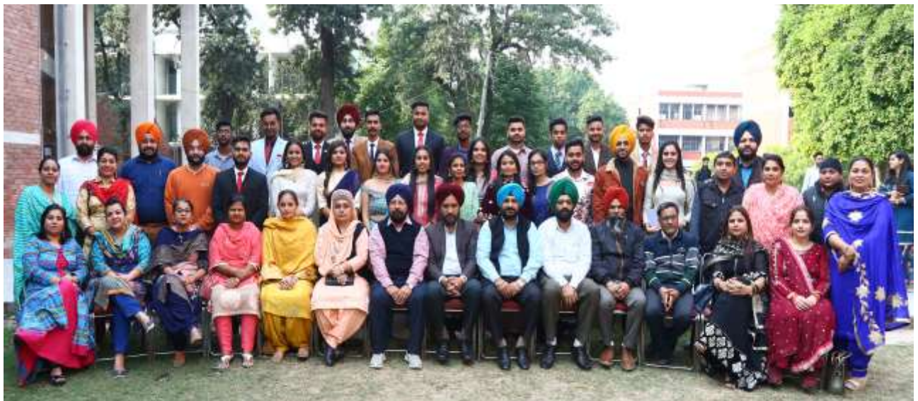
Department of Electronics and Communication Engineering