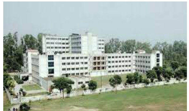
Baba Banda Singh Bahadur Hostel (BOYS)