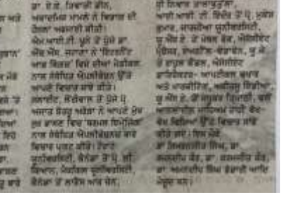
ਇਲੈਕਟ੍ਰੋਨਿਕਸ ਅਤੇ ਕਮਿਊਨੀਕੇਸ਼ਨ ਵਿਭਾਗ ਵੱਲੋਂ ਵਿਦਿਆਰਥੀਆਂ ਦਾ ਟੈਲੇਂਟ ਹੇਂਟ ਪ੍ਰੋਗਰਾਮ